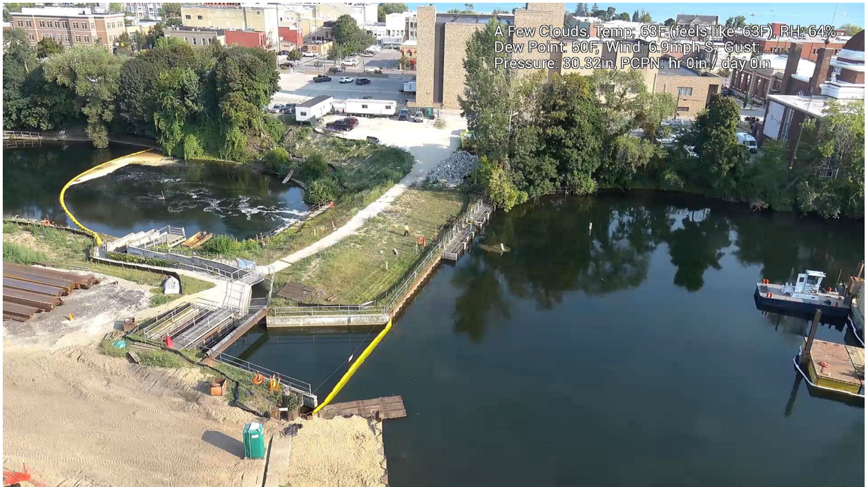
Figure 2. Image capture from the FishPass time-lapse camera: September 04, 2024 – 9:51 AM.